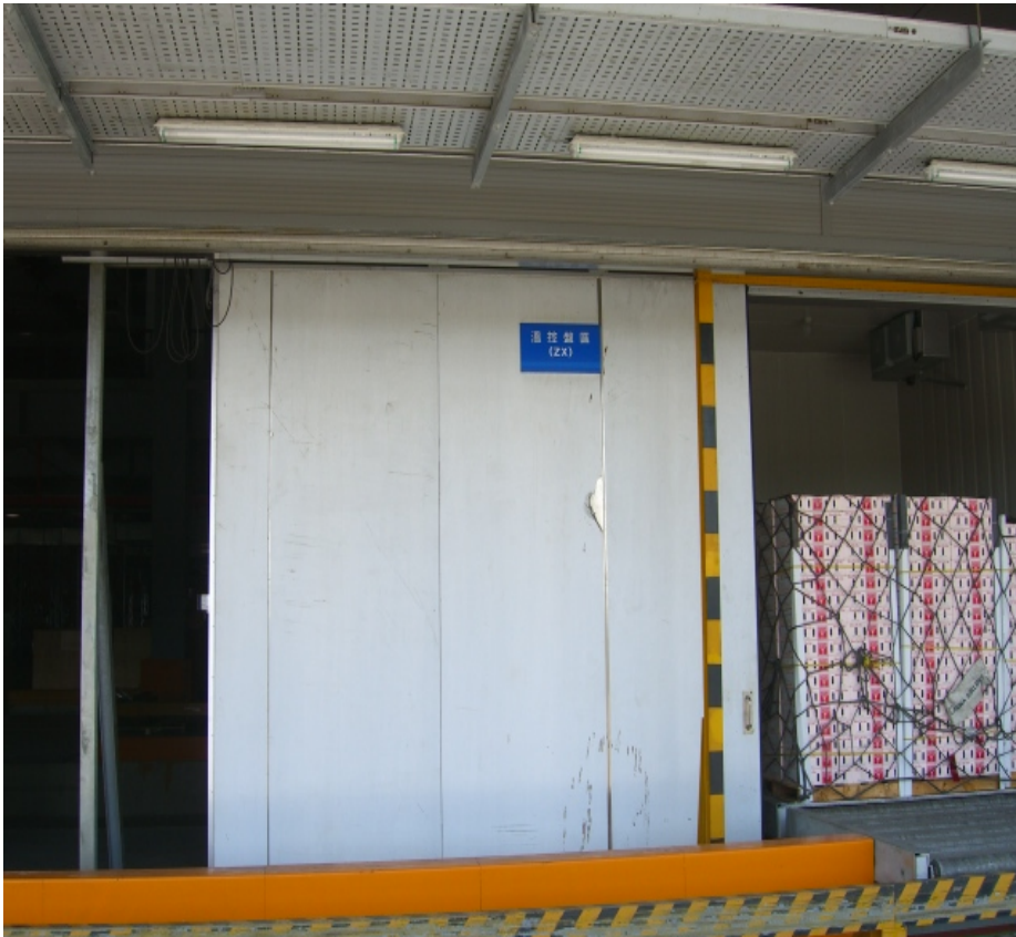
Constant Temperature Storage