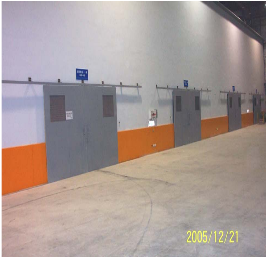
Dangerous Goods & Radioactive Materials Warehouse