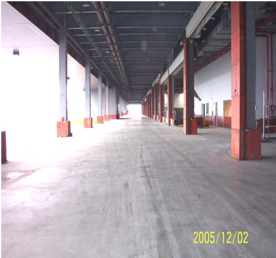
12 Meter Deep