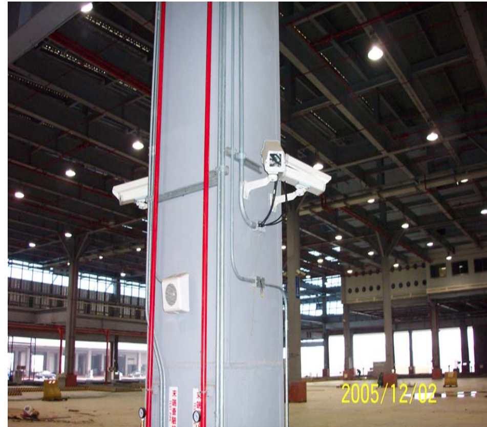
Close Circuit TV-1258 set