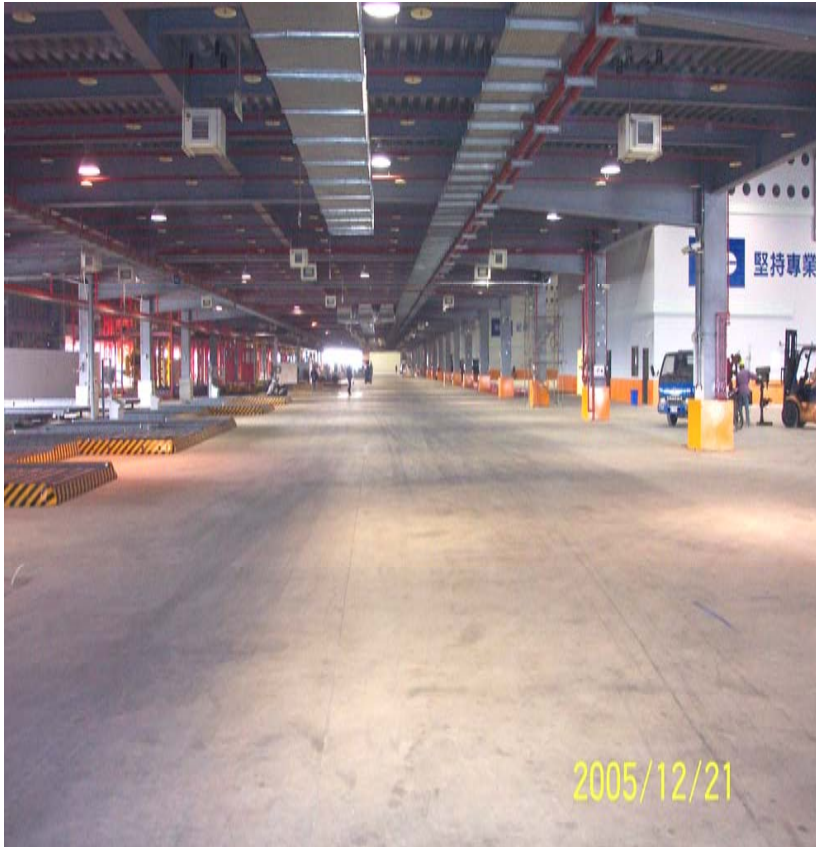
22 Meter Deep