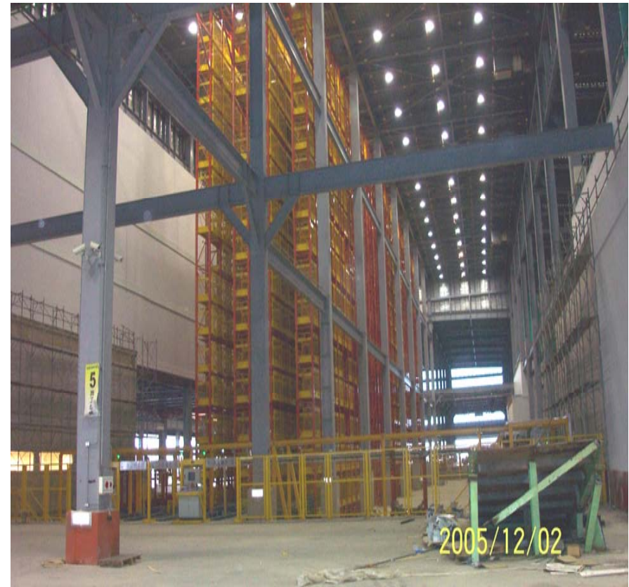
ASRS Position: 2,400bins