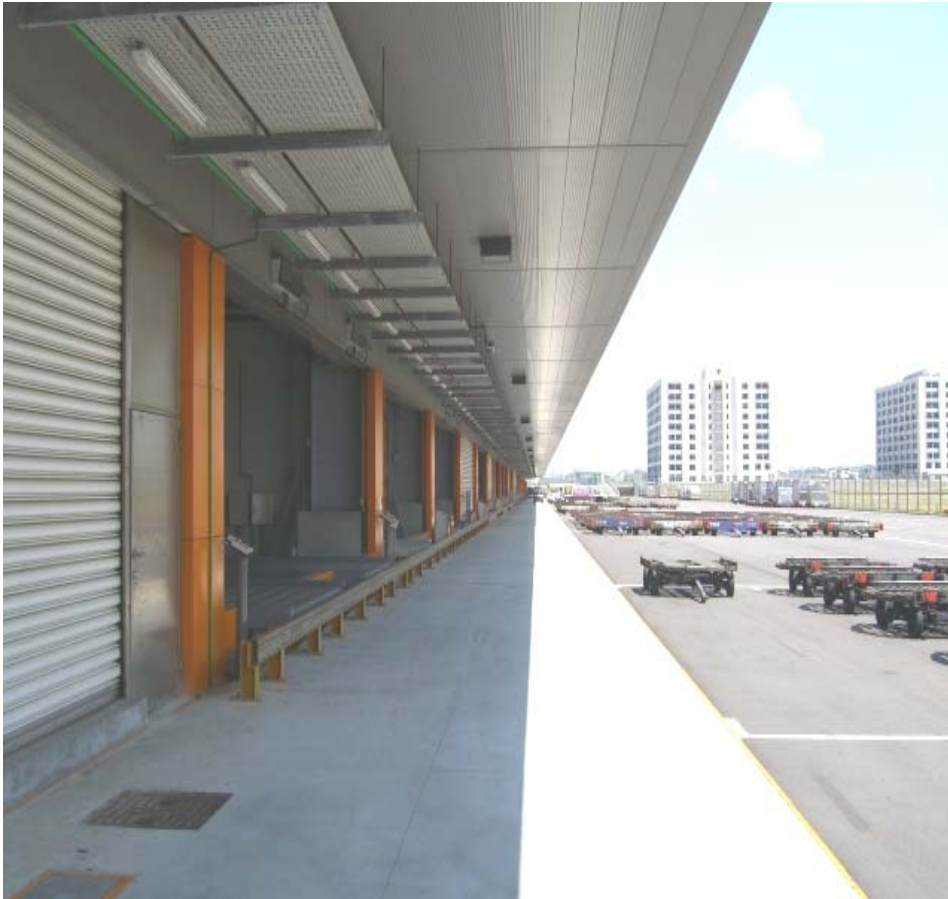
45 Pallets Complete Exit