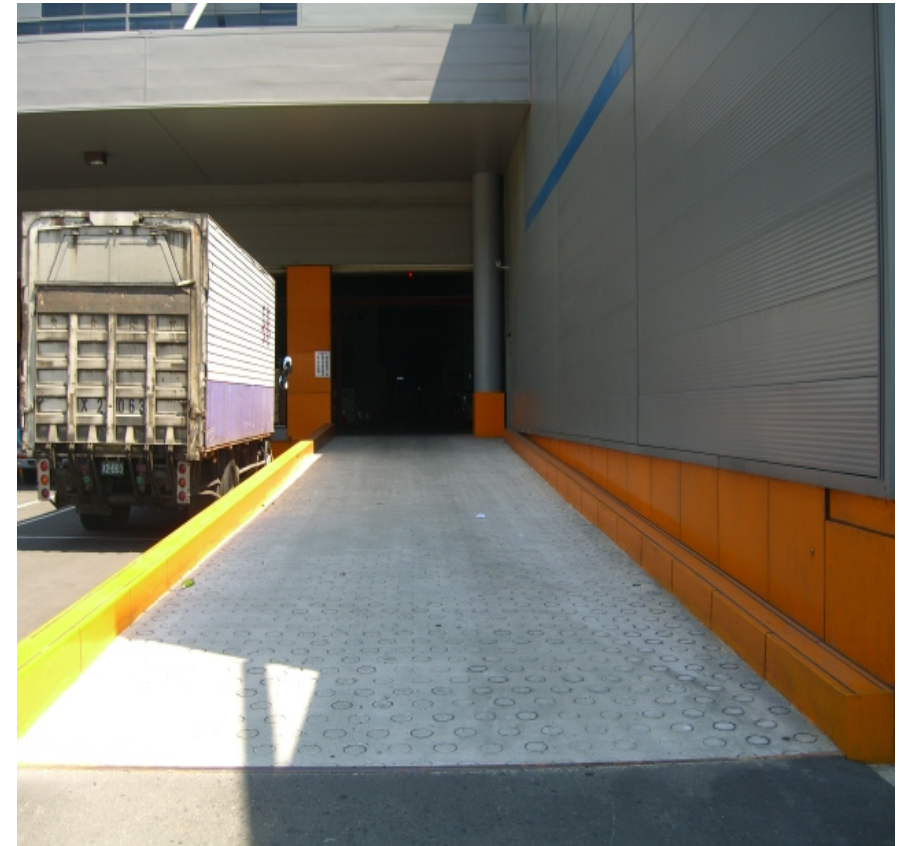
Cargo Express Entrance