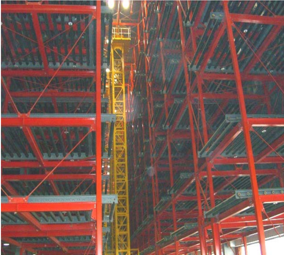
ASRS Position: 2,400bins